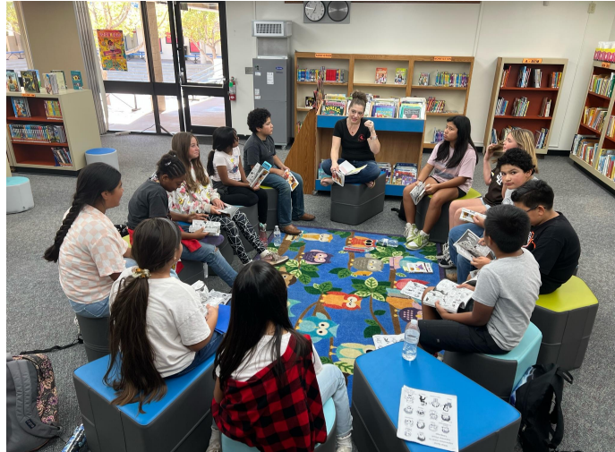
Students using modular furniture to form a collaborative discussion space