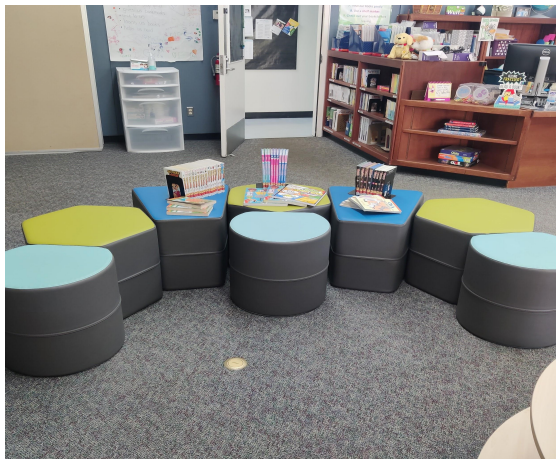
Items purchased for Library

With my grant, I purchased 4 series of Manga books, 3 copies of one stand alone manga book, 3 How to draw manga books, and one book of graphic novel pages to copy for the library. I was also able to purchase 8 pieces of movable furniture to add to others in the library to form collaborative spaces. I also purchased the first book from 2 different manga series along with the How to draw manga book for each of the (12) book club participants.