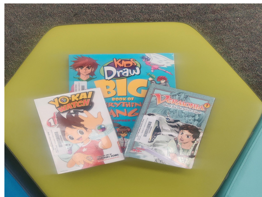
Items each book club participant received