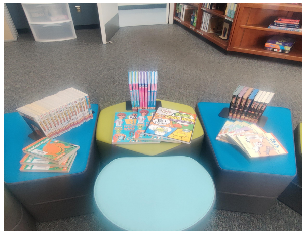
Books purchased for library